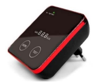
Complies with EN 50194 and UL 1484